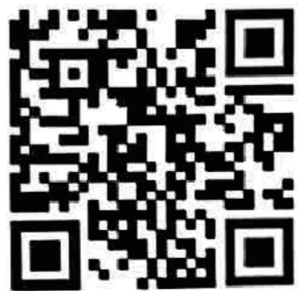
AI-win Lucier - There Is No Room