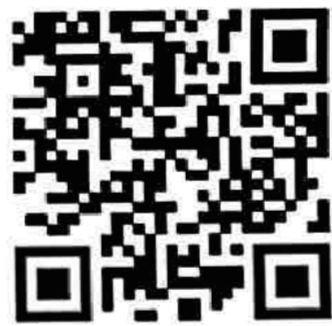
Singing and Drumming